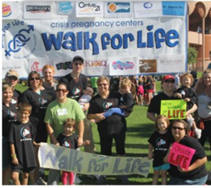
CPC Walk for Life