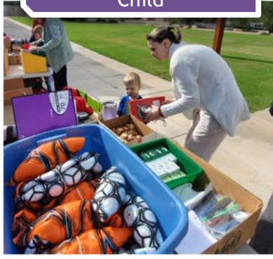
Operation Christmas Child