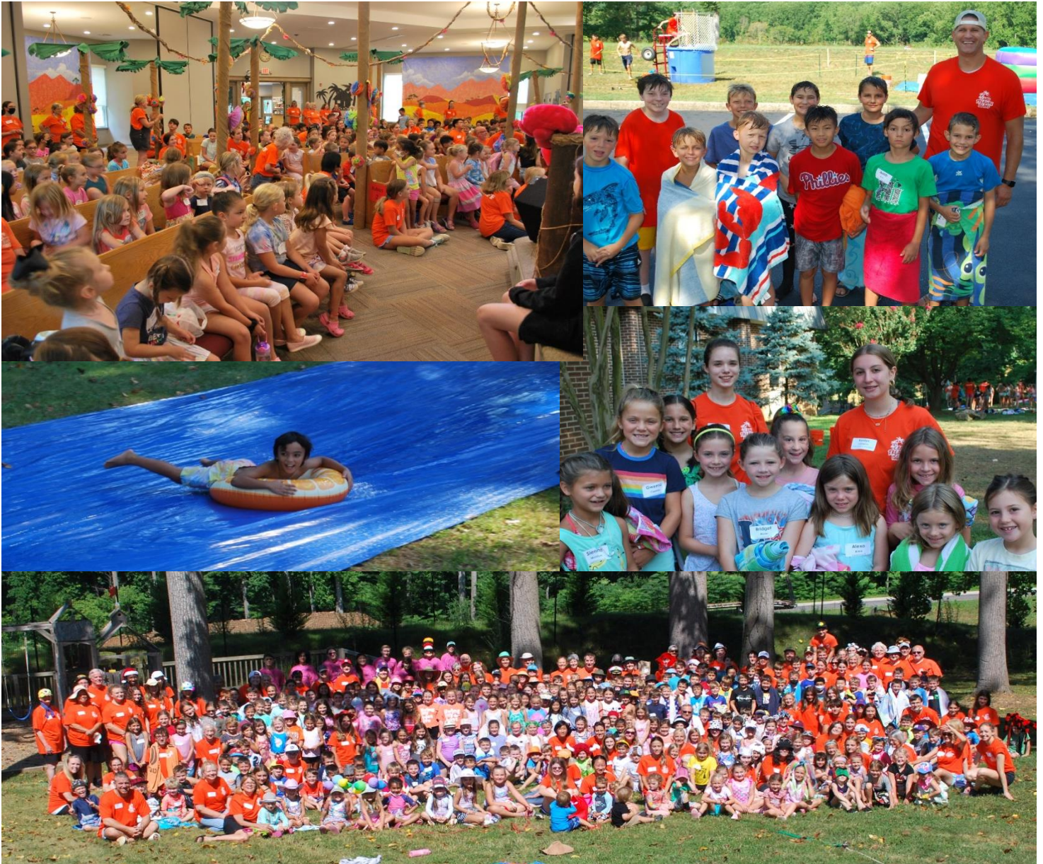
Summer VBS: Camp Treasure Island