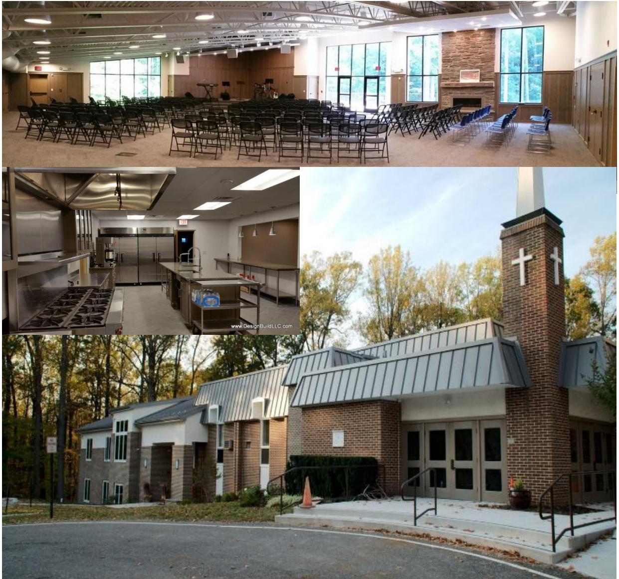
Top: Fellowship Hall; Bottom: Sanctuary Entrance; Inset: Commercial Kitchen