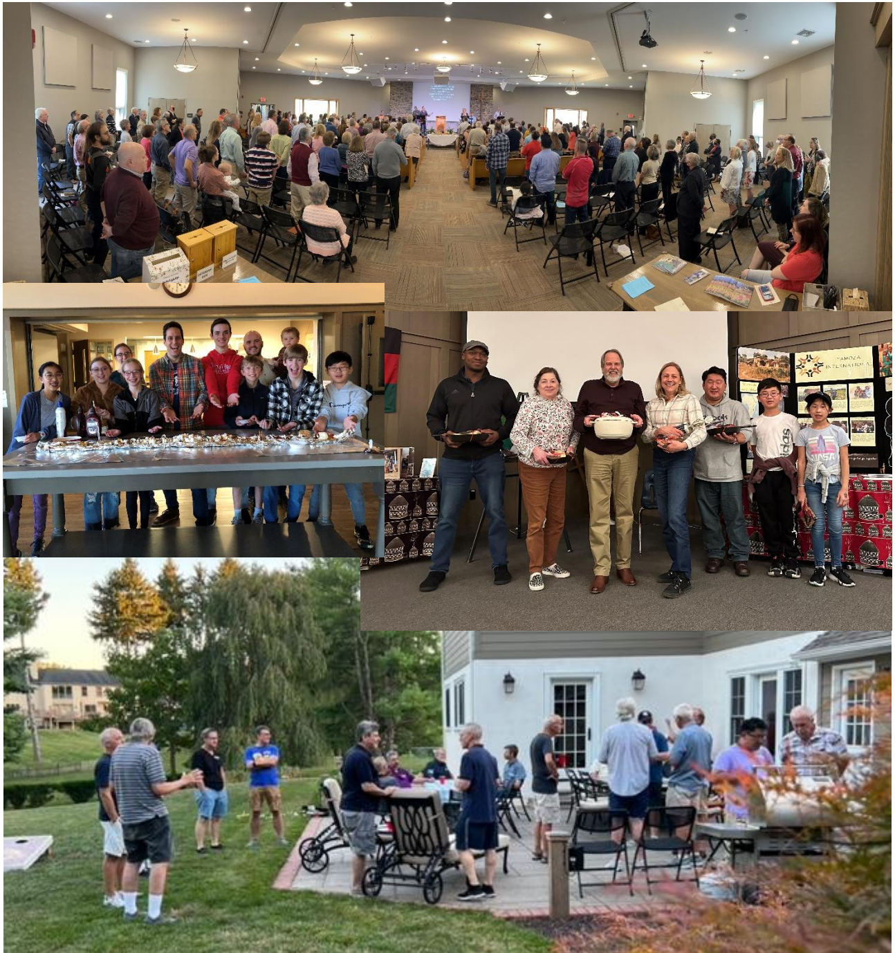
Clockwise from top: Worship, 2023 Chili Cook-off Winners; Men's Networking Night; Youth Group