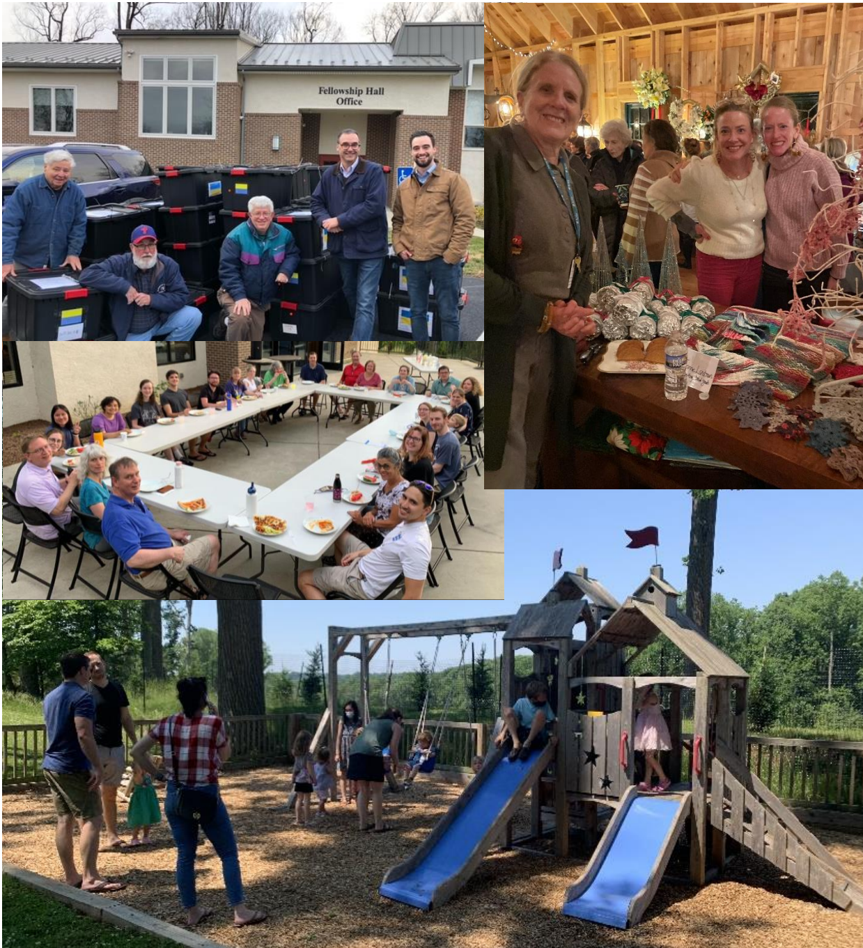
Clockwise from top: Presbytery Crates for Ukraine, Artful Women of SLPC Christmas event, after service fun at the toddler playground, combined Community Group homemade pizza