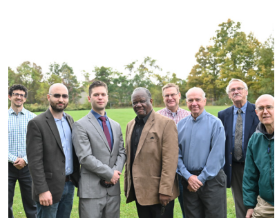
8 Deacons 4 Ordained and 4 In-Training