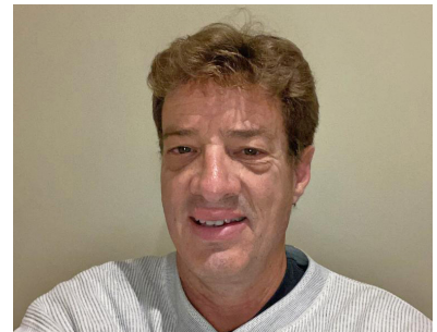
1 Youth Director Part-time