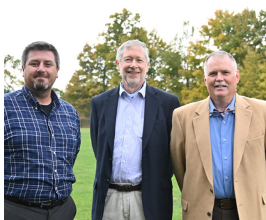
3 Ruling Elders