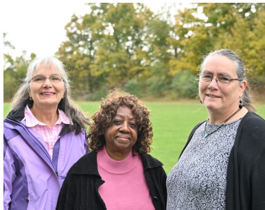
3 Deaconesses Non-Ordained