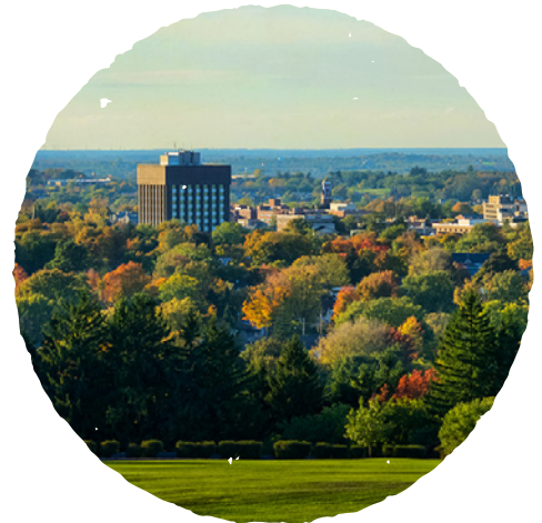
New York State Zoo at Thompson Park