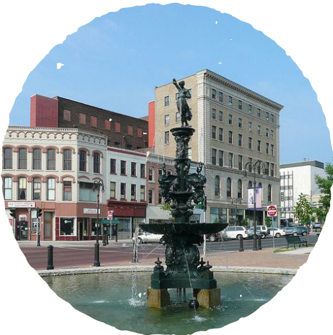
Historic Public Square