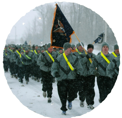
10th Mountain Division

Watertown currently has only 1 evangelical church per 2,703 people, and there is no confessional Reformed and Presbyterian church in all of Jefferson County.