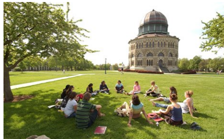
Nott memorial at Union College