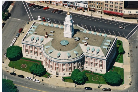
Schenectady City Hall