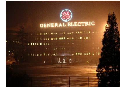
GE, the world's 3 rd largest company, had its original headquarters in Schenectady.