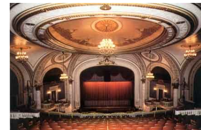
Proctor's Theatre, part of Schenectady's Fine Arts District